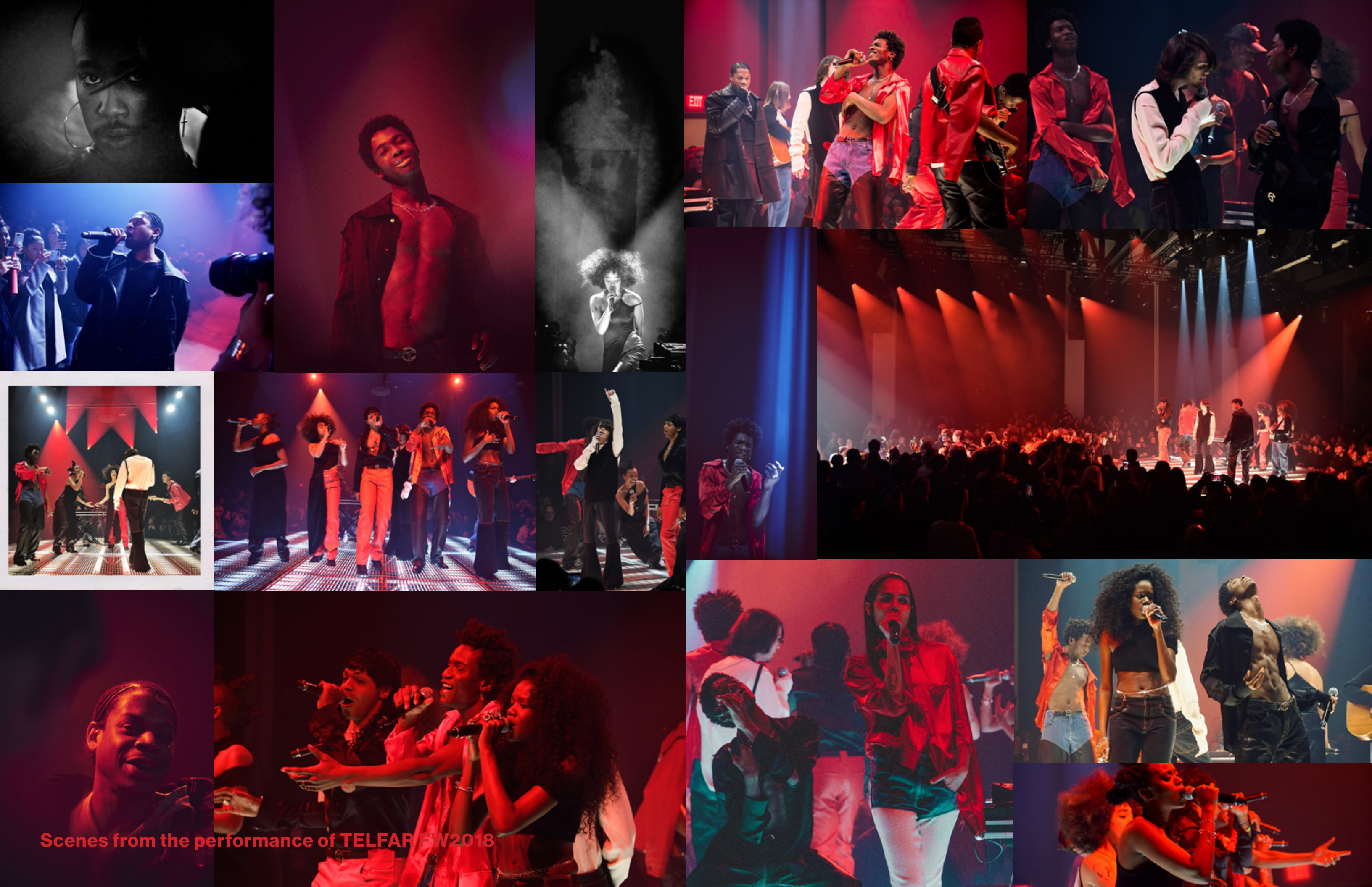
Scenes from the performance of TELFAR FW2018