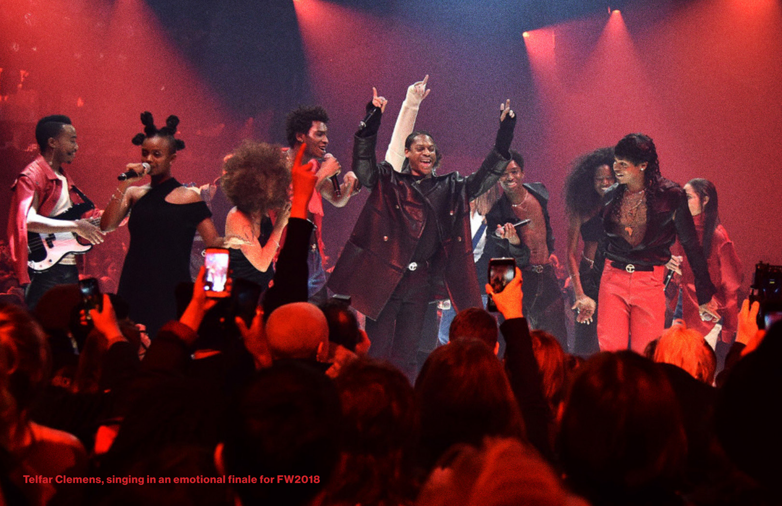
Telfar Clemens, singing in an emotional finale for FW2018