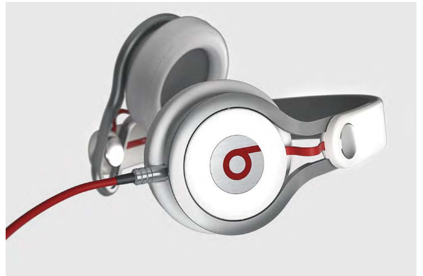
Mixr & Urbeats