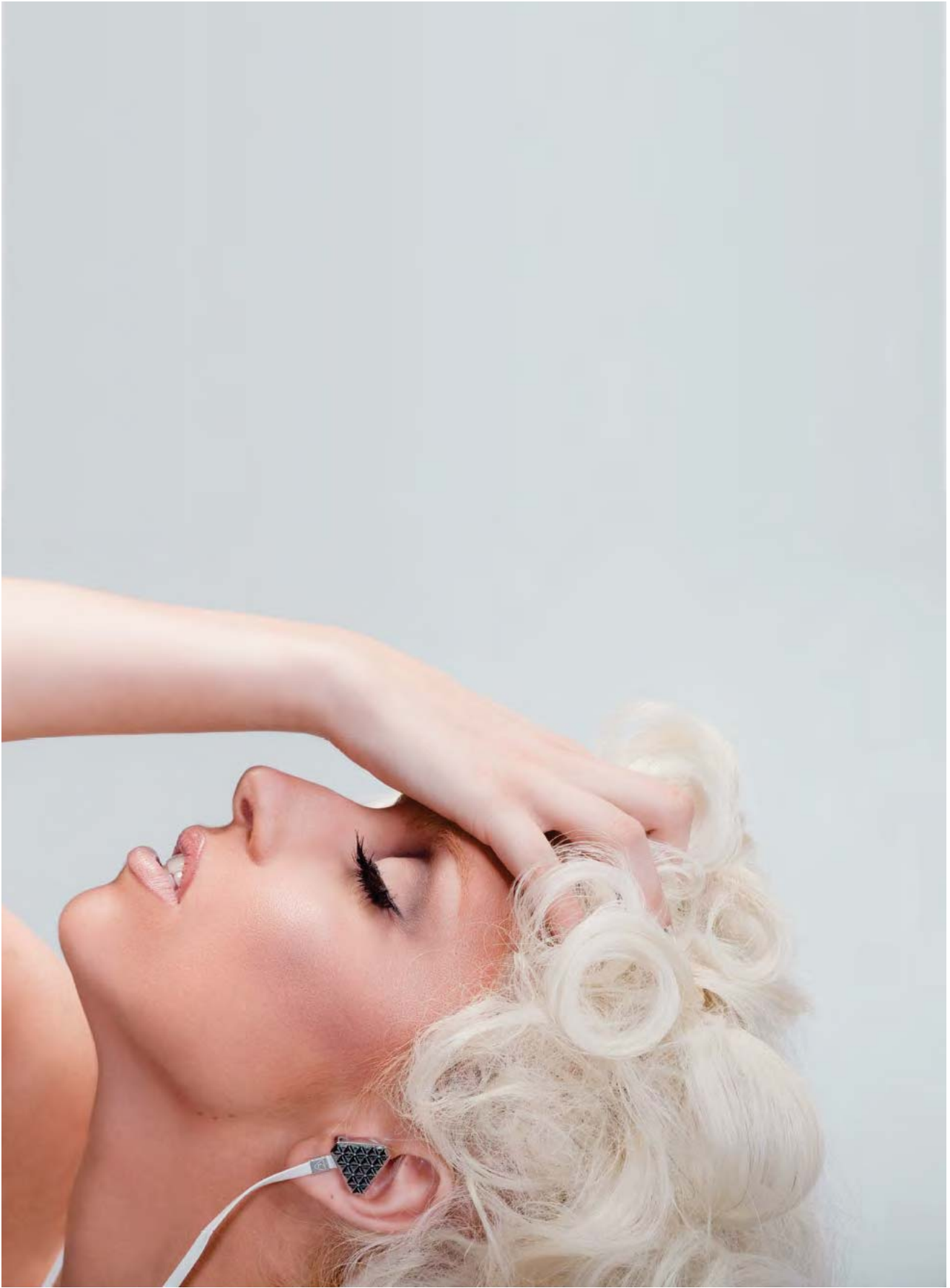
Heartbeats by Lady Gaga