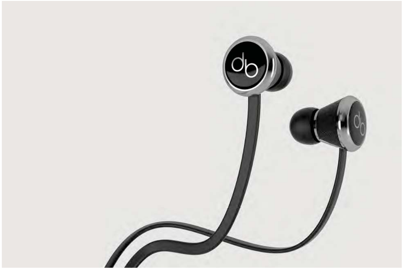
Powerbeats & Diddybeats