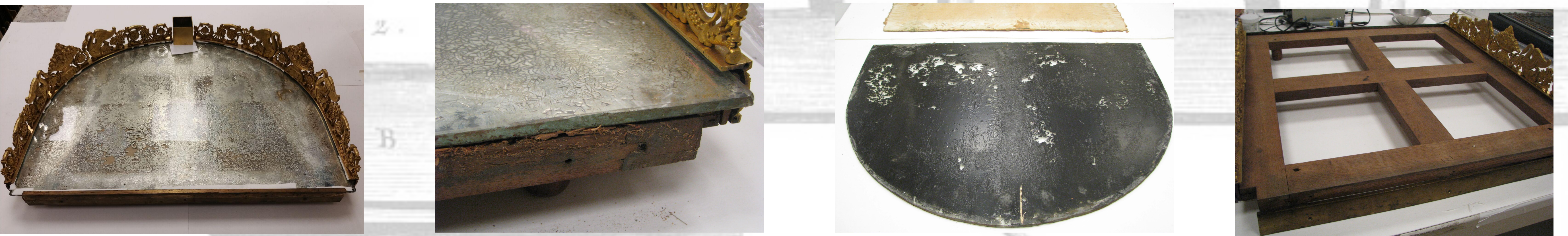
Captions, from left: end panel before treatment; detail, corner, before removal from frame; recto, end panel before treatment and after removal from the frame; frame

Condition: Large areas of the metal leaf had cleaved from the glass and these islands of lifted leaf were adhered to the cardstock backboard in many locations. The silver still in contact with the support appeared crazed and oxidized, resulting in diminished reflectance. The edges of many flakes exhibited dark tarnish. Not surprisingly, the pattern of loss generally reflected the shape of the wood frame holding the glass and frames together, such that where air and moisture circulated more freely, more leaf had detached; this condition created an unintended cross-like appearance on the mirror.