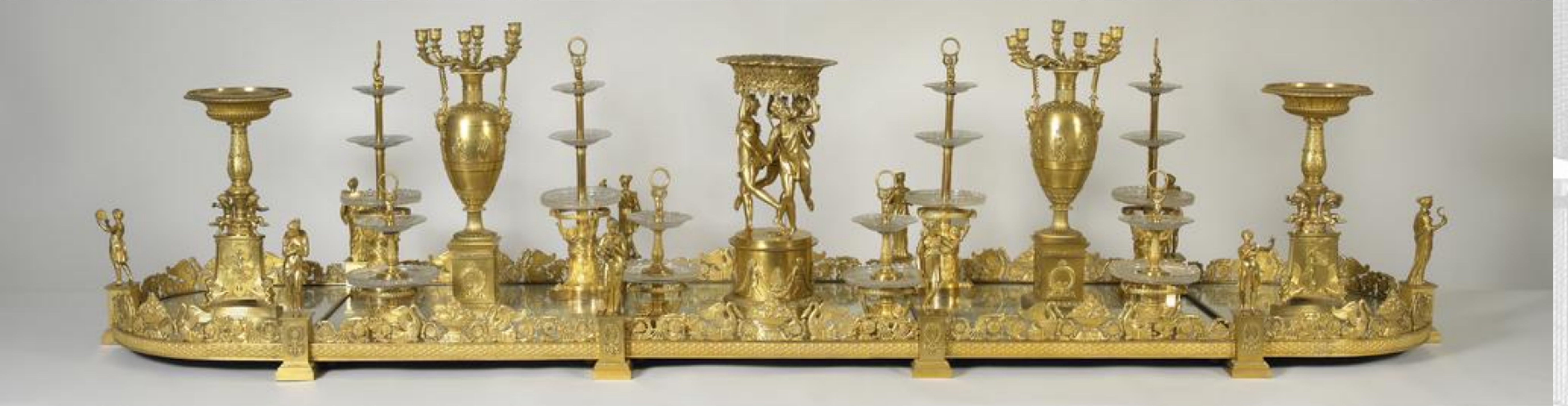
Surtout de table 1991-31-1-a/ww

Background: The Cooper Hewitt Smithsonian Design Museum (CHSDM) recently conserved a spectacular ormolu surtout de table (ca. 1805) by Pierre-Philippe Thomire (1751-1843), chaser-engraver to Napoleon. This elaborate dining-table centerpiece consists of five silver-leaf mirrored trays, which together measure over ten feet long, each set in an ormolu frame. Over 50 gilt-brass elements comprising tiered servers with cut-glass bowls and other decorative elements sit atop the mirrors. While the flat glass supports for the mirrors were in excellent condition, examination of the object revealed that the reflective backings were unstable, requiring extensive conservation treatment.